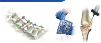
Spinal, Trauma, Joints, Sport Medicine