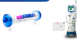
Dialyzing, PD, Machines and Services