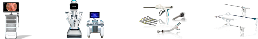
Surgical instrument, Electrosurgery, Sutures, Dressings, Robotic Endoscope