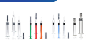
Prefilled Drug Delivery